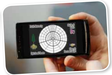
Concept artwork for the new Leadership Development mobile application.